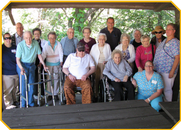
Platte River State Park is a wonderful place for a September outing.