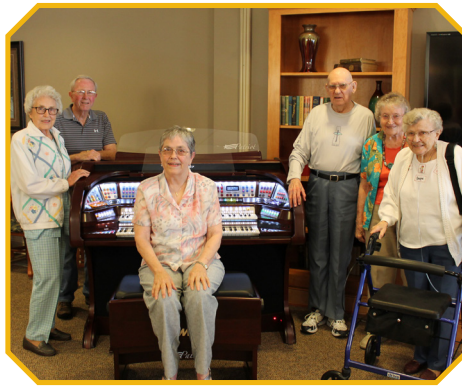
"Life" organ music group gave a fantastic concert.