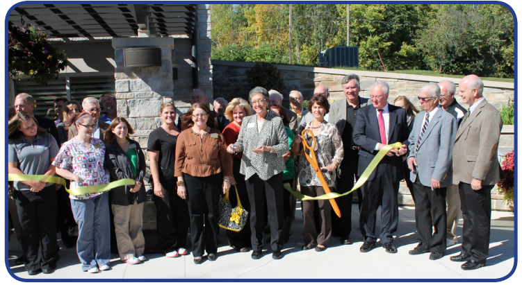
Chamber of Commerce Ribbon cutting ceremony on Oct. 8th.

It has been and will continue to be a privilege for me to serve as Executive Director of The Nebraska Masonic