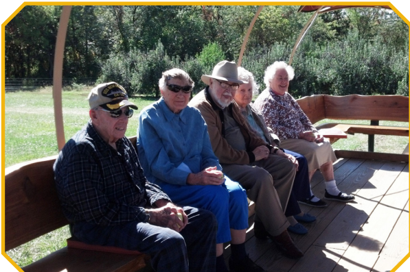
A Discovery Ride through Union Apple Orchard was very interesting