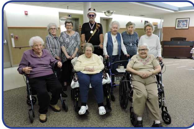
Plattsmouth Harvest Festival King and the residents