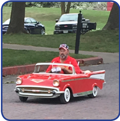
Plattsmouth Harvest Festival