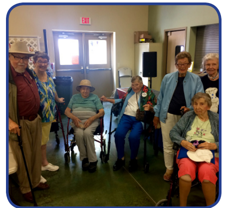
2017 Cass County Fair