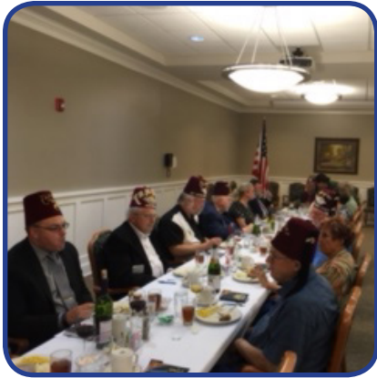
Tangier Past Master Shrine Club