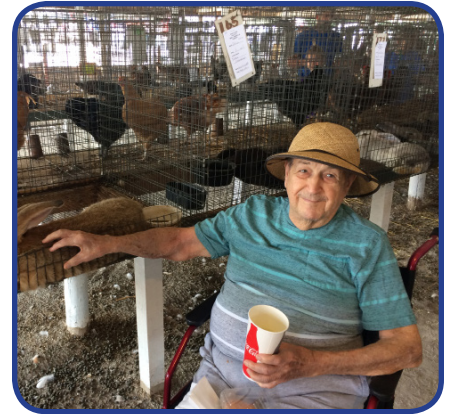
2017 Cass County Fair