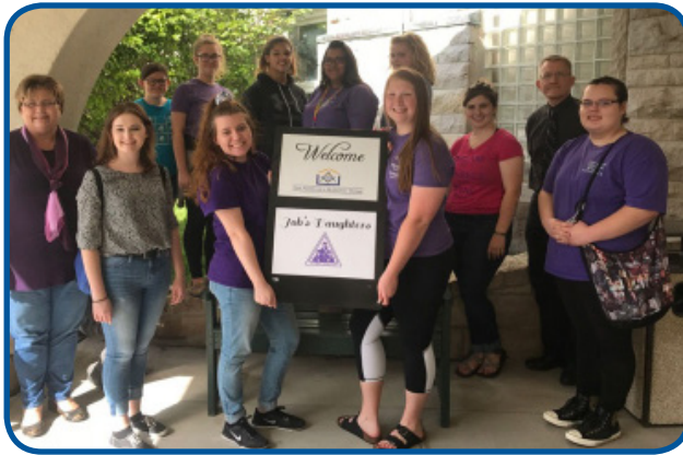
Art Class at The Home