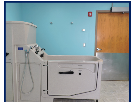
3rd Floor Remodeled Tub Room