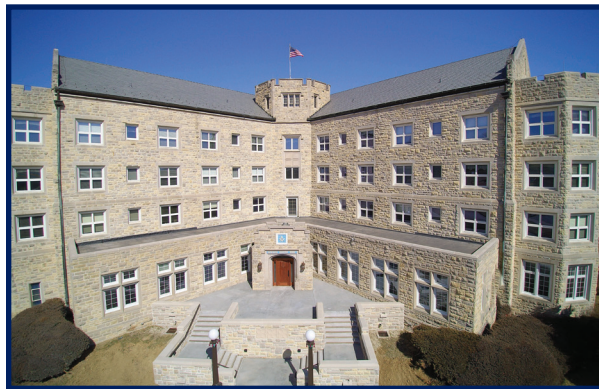
Front Porch 1952 Wing