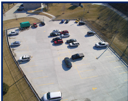
Employee Parking Lot

replacement of the front porch with added safety lighting, the replacement of the doors of the main entrance of the 1952 Wing and the north door of the 1924 Wing with beautiful new energy efficient doors, and finally the removal and replacement of the employee parking lot due to a huge sink hole. The Nebraska Masonic Home takes pride in keeping up with repairs throughout the facility in order to continue a century long tradition of providing our residents with a safe and secure home. Thank you for your continued support . . . your generosity is very much appreciated.