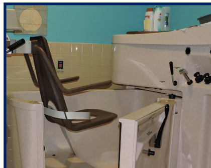
New Tub in the Special Care Unit