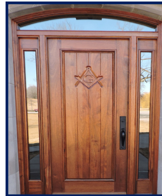
Front Door 1952 Wing