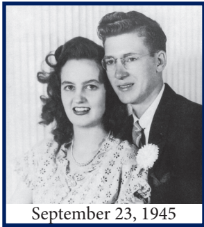
September 23, 1945