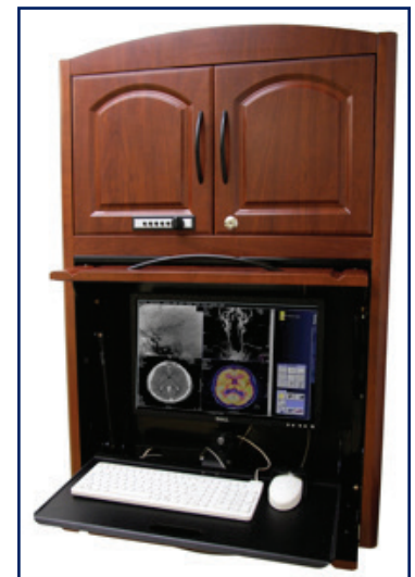
Electronic Charting Station